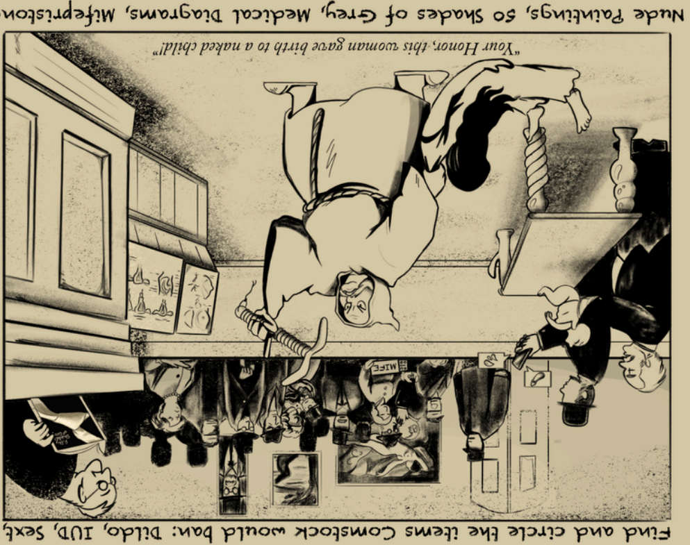
Find and circle the items Comstock would ban: Bildo, IUD, Sexl Nude Paintings, 50 Shades of Grey, Medical Diagrams, Mifepristone

WHY WE GOTTA REPEAL THIS SHIT ASAP Because the Comstock Act is still on the books, and is currently being cited in court cases as a reason to drastically reduce abortion pill access. If you can't send ANYTHING abortion related through the mail, then the Comstock Act effectively becomes a FEDERAL ABORTION BAN – regardless of your state's laws protecting abortion access.